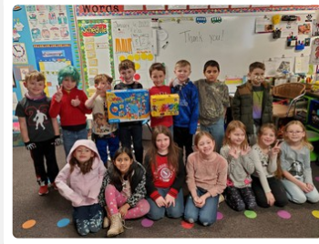
First graders excited about new games