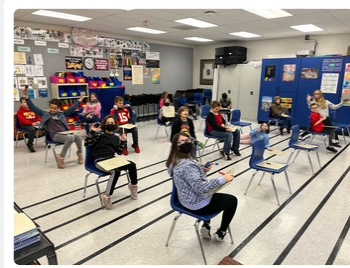
McEowen music students using new dry erase boards & markers

Gaddie, Sweitzer to be inducted into Alumni Wall of Fame