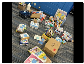
Items ready for pick-up at Harrisonville Elementary