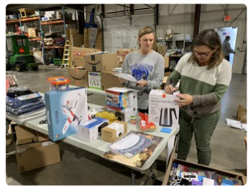
Foundation trustees sorting the purchases