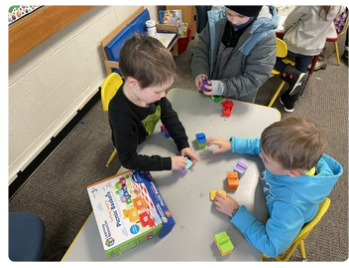
Preschool students enjoying new items